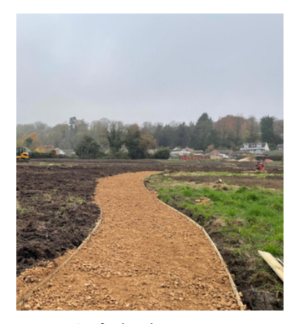
Surfacing in progress