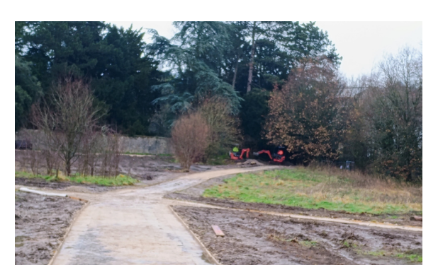
The new junction