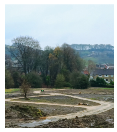
Overview of paths