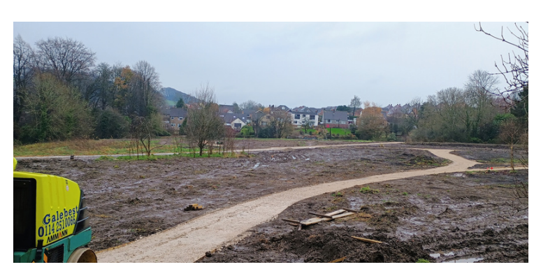
Rolling the paths